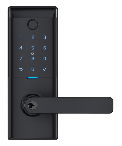
SCHLAGE ASCENT SMART ENTRANCE LEVER

Experience unparalleled convenience and security with the Schlage Ascent Smart Locking range, the ultimate upgrade to modernise any home.