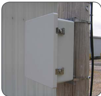
Pole mount kits fit a variety of enclosure sizes to fit your application