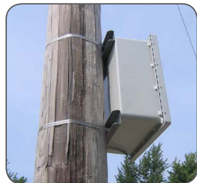
Pole mount brackets fit securely to round, square, or rectangular pole