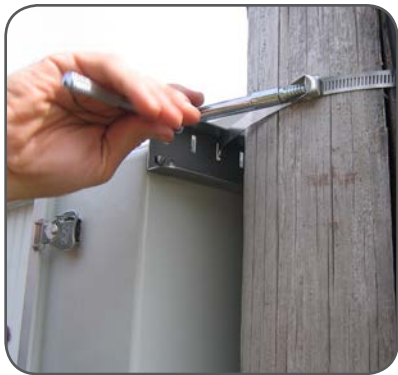
Pole mount brackets secured with wire and screw clamp

The Pole Mount Kit offers a unique solution with feature rich components to aid in hanging and mounting your enclosure on your specific application. Here are just a few of those features: