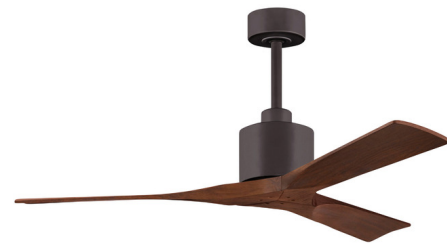
Shown in textured bronze / walnut tone