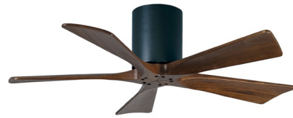
Shown in matte black / walnut tone