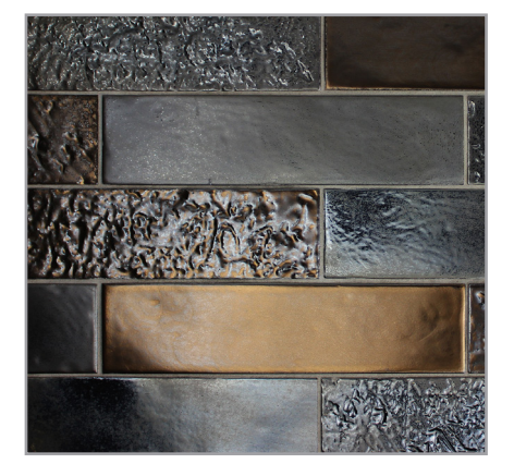
Reef (2 \% \times 9 \%) Equal blend of smooth and textured surfaces.