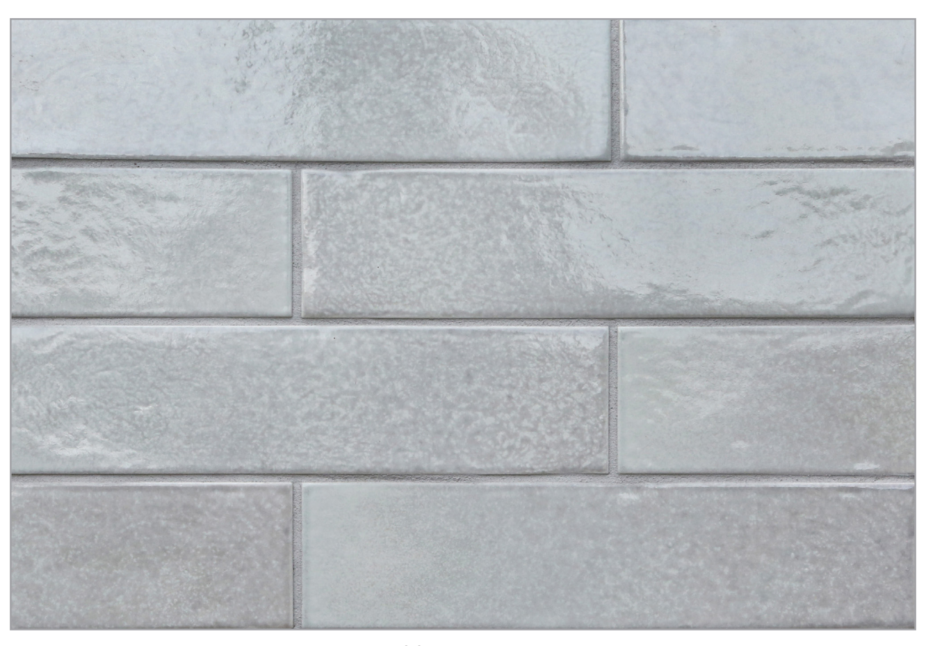
Moonstone Glaze color may show shade variation between batches. Visit LunadaBayTile.com for more images.