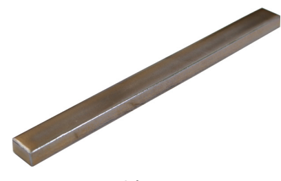
Liner (¾ x 9 ½)