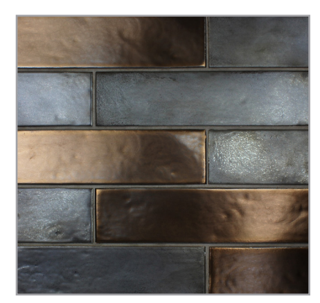
Smooth \\ (2 \ \ \ \times \ 9 \ \ \ \ ) Contains only pieces with minimal textural variation.