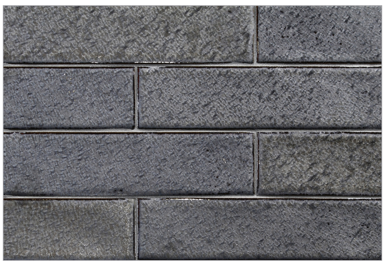
Cape Pearl Glaze contains multiple color variations between pieces. Visit LunadaBayTile.com for more images.