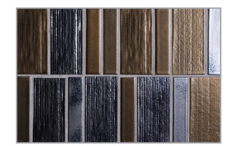
Swell Mosaic (¾ x 3 ¾, 1 ½ x 3 ¾)