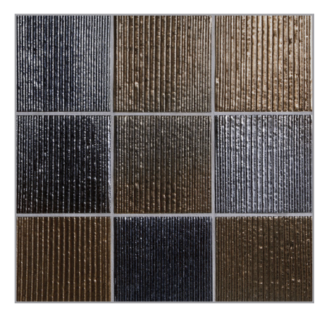
Tide (4 x 4)