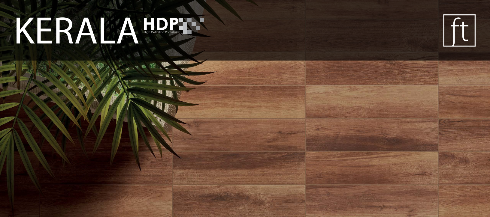
above: 34293 6x24 Mantra