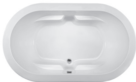
Shown with optional integral armrests