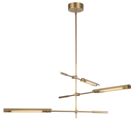
Shown in vintage brass / clear

The Astrid Multi Light Pendant features Metal shades with an Urban Bronze or Vintage Brass finish. Includes 2, 3, or 6 shades, each with an integrated LED light source and a Clear Glass lens. Bars can be twisted to provide uplighting or downlighting. ETL listed.