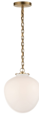
Shown in hand-rubbed antique brass / white