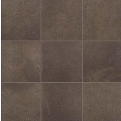
AV213 ▶ Bistro Brown