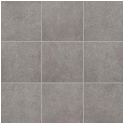
AV214 ▶ Gallery Grey