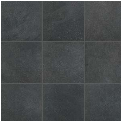
AV215 ▶ Boutique Black