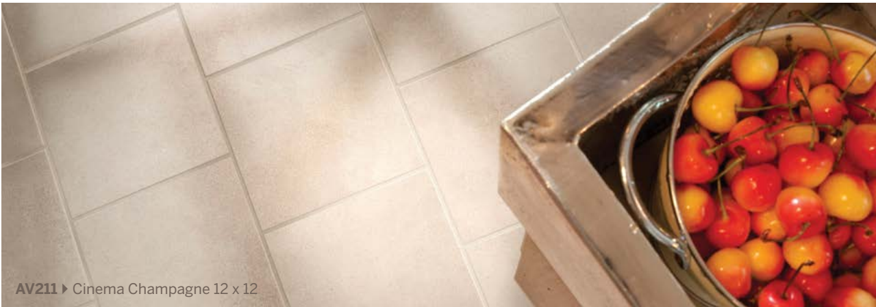
AV211 ▶ Cinema Champagne 12 x 12