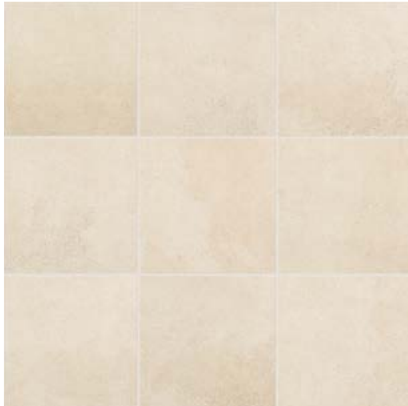
AV211 ▶ Cinema Champagne