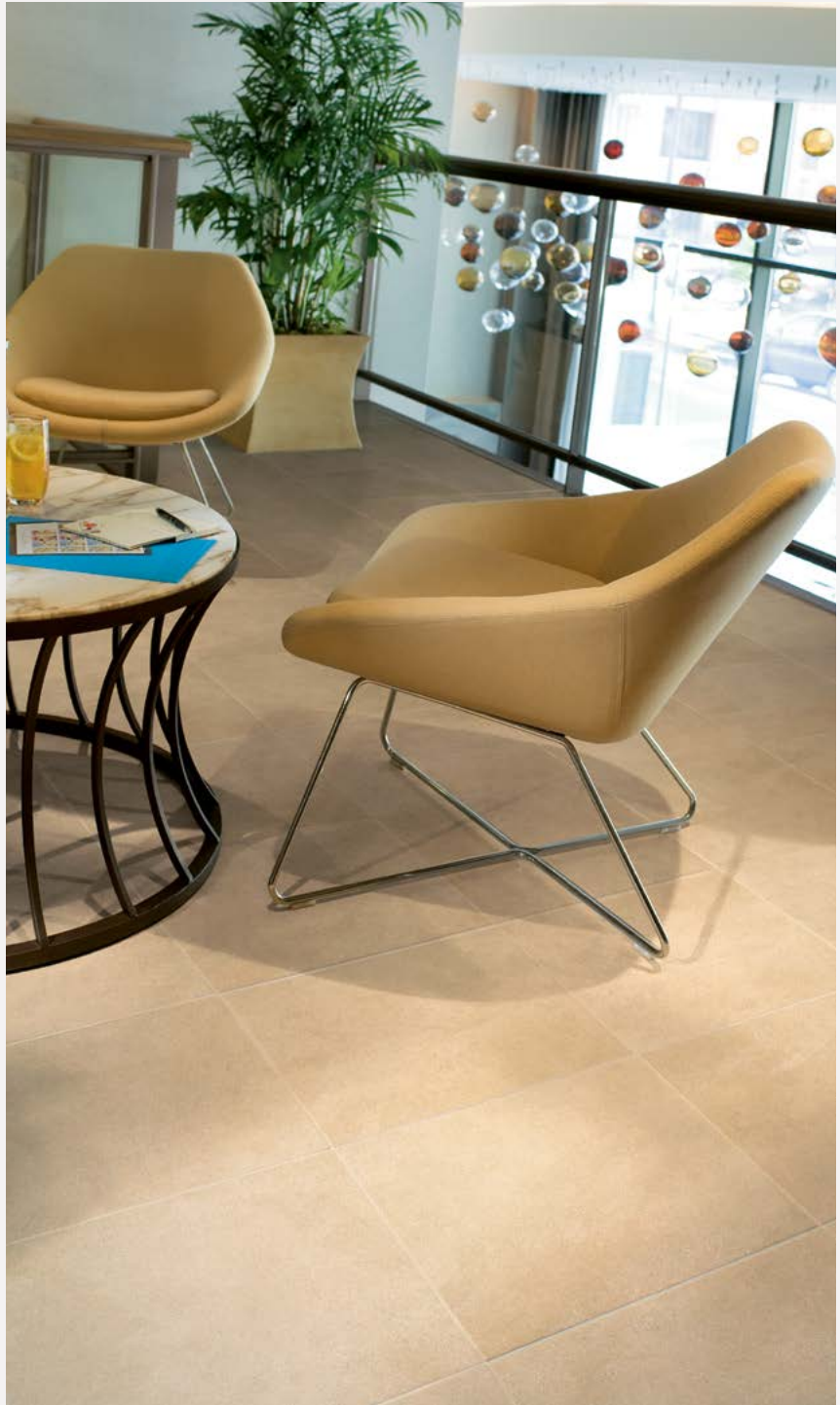
AV212 ▶ Café Caramel 18 x 18