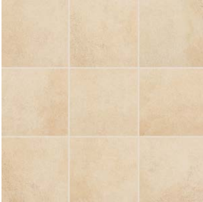
AV212 ▶ Café Caramel