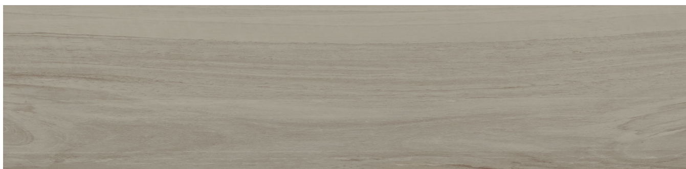
RLX03 ▶ Woolen UP