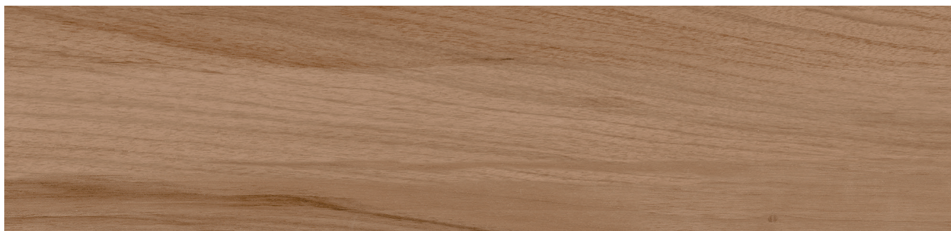
RLX02 ▶ Nutmeg UP