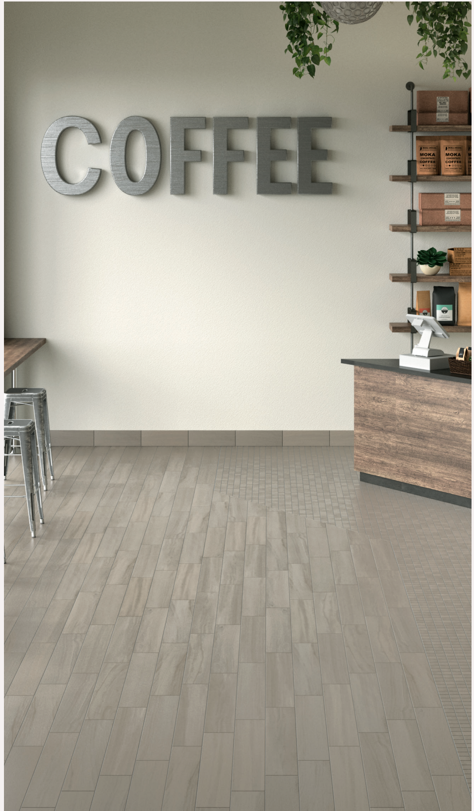
RLX03 ▶ Woolen 6 x 36 UP and 2 x 2 Mosaic