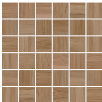
RLX02.10202MOS Nutmeg 2 x 2 Mosaic UP