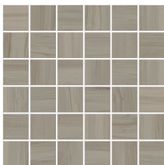
RLX03.10202MOS Woolen 2 x 2 Mosaic UP