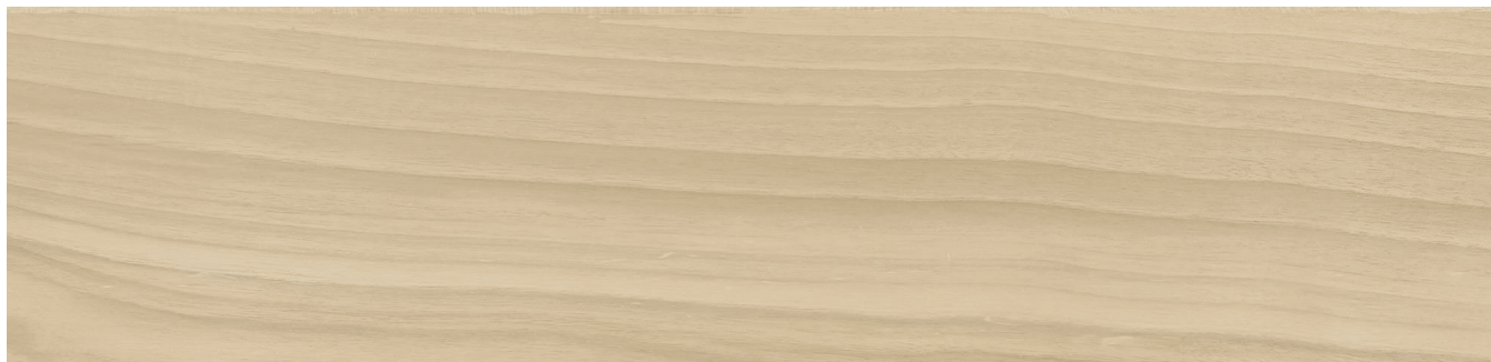
RLX01 ▶ Chiffon UP