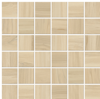
RLX01.10202MOS Chiffon 2 x 2 Mosaic UP