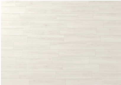
White Wash VTL HPWW