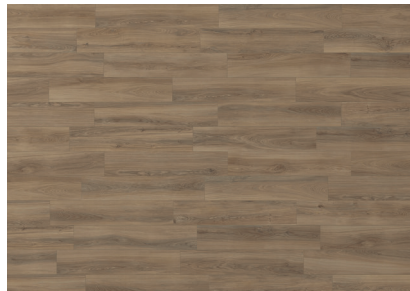
Jacobean VTL HPJA