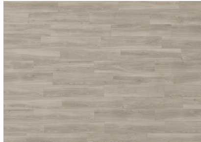
Weathered Grey VTL HPWG