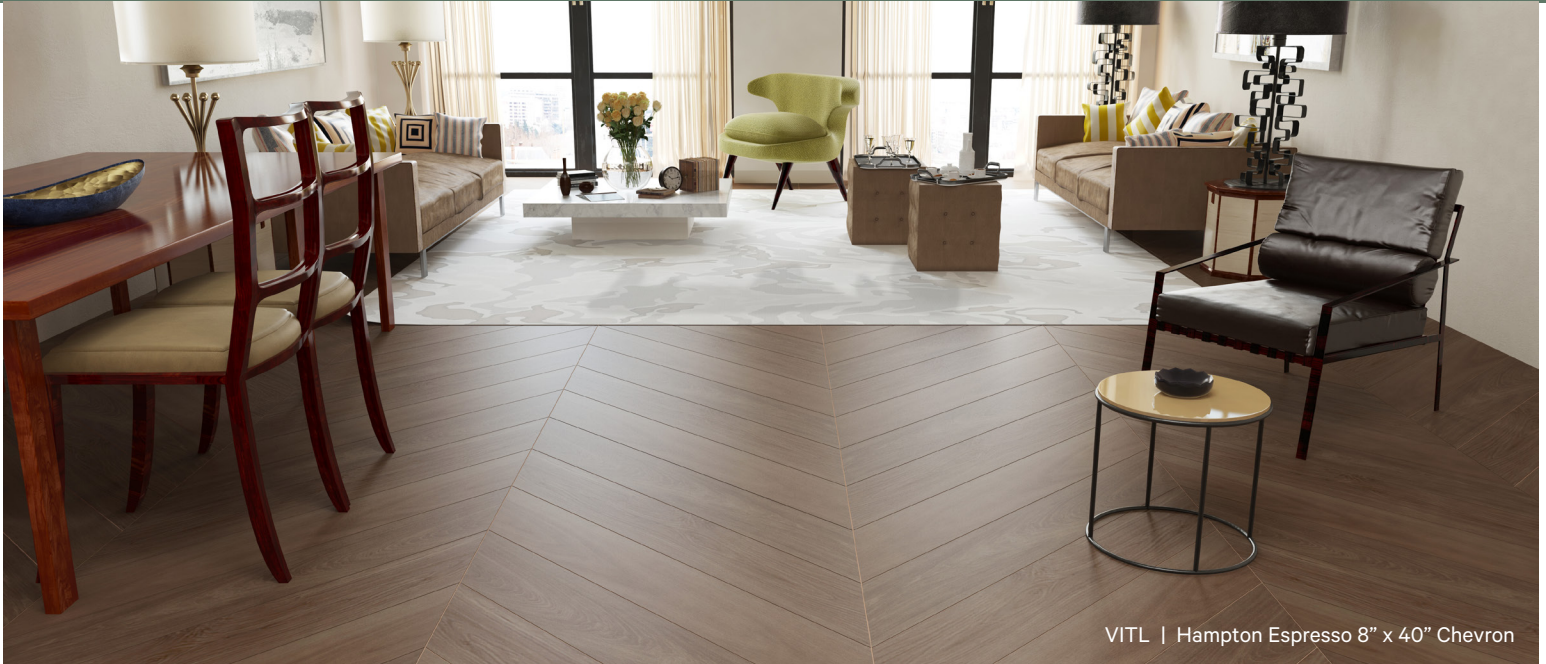
VITL | Hampton Espresso 8" x 40" Chevron