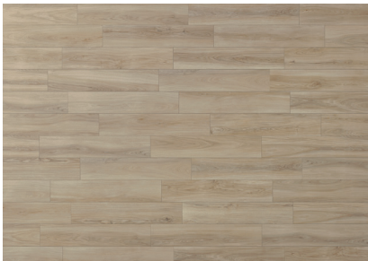
Sun Bleached VTL HPSB