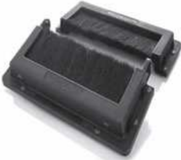
Original - Part No. 2020