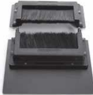
Large - Part No. 2030