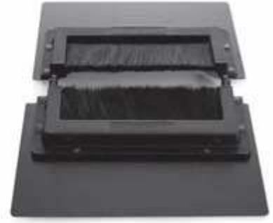
XLarge - Part No. 2040