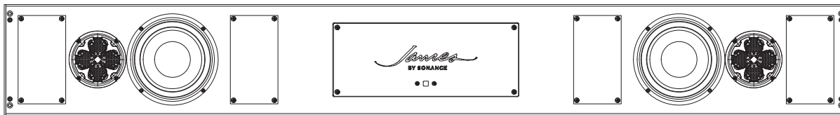
Front View Built-to-Order Width