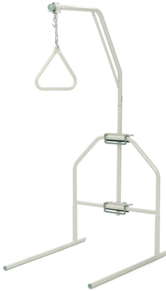
7714P: shown with 7740A 7740A: Includes bar, brackets and grab bar