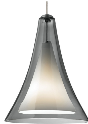
Shown in satin nickel / smoke