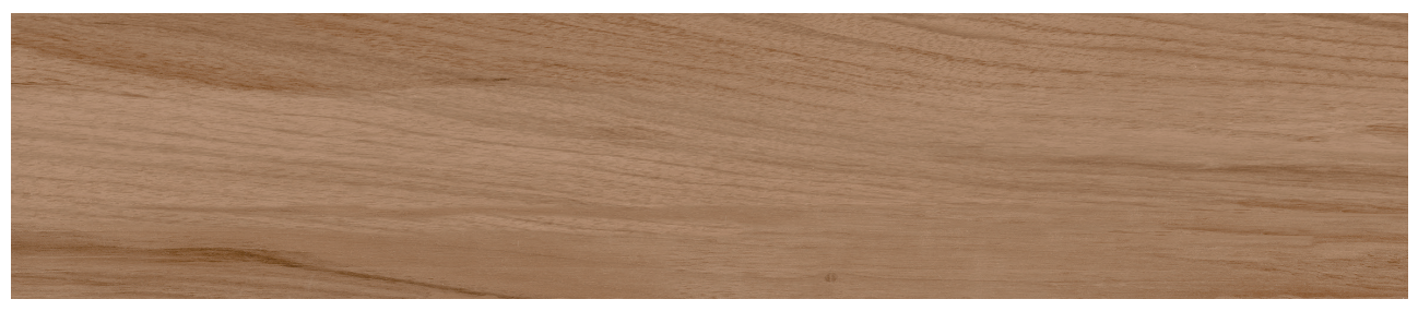
RLX02 ▶ Nutmeg