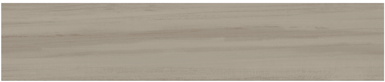
RLX03 ▶ Woolen