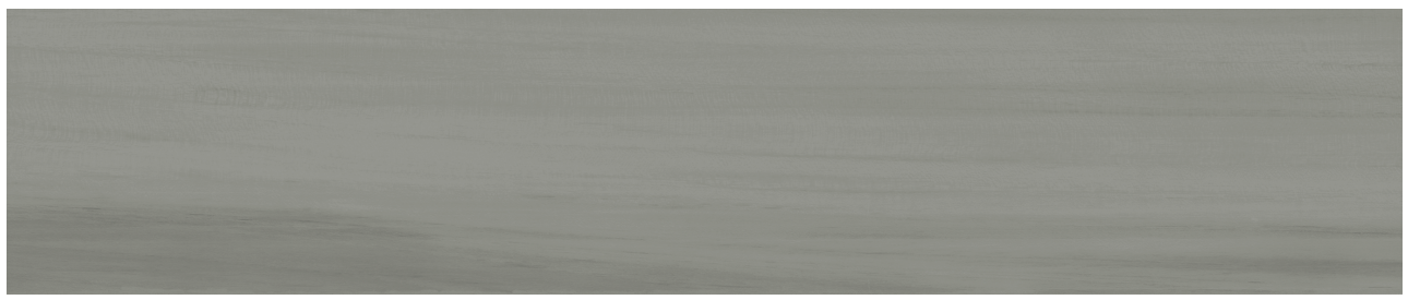
RLX04 ▶ Caviar