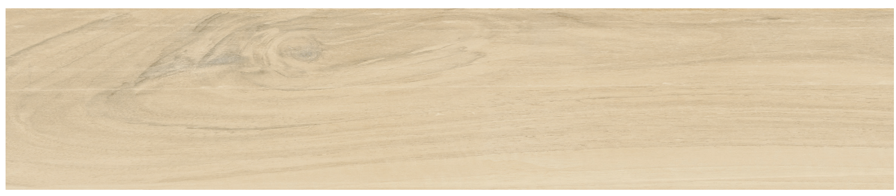
RLX01 ▶ Chiffon