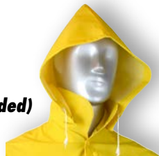
Detachable Hood (Included)