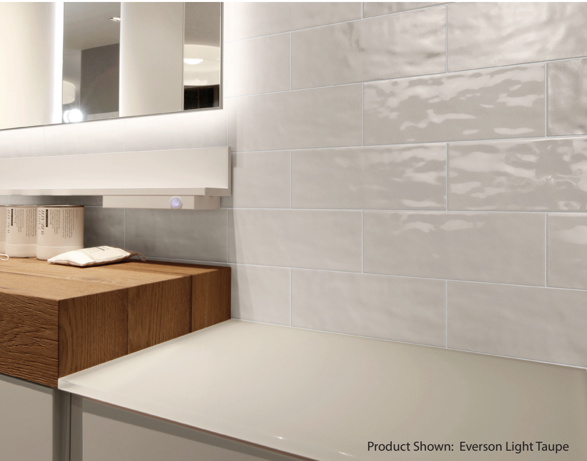
Product Shown: Everson Light Taupe