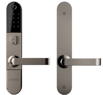
External lock body