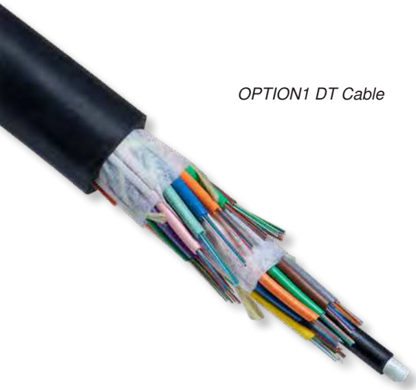
OPTION1 DT Cable

New Totally Gel-Free, Riser-Rated Cable Enables Faster, Less Costly Deployment for Inter-Building Applications