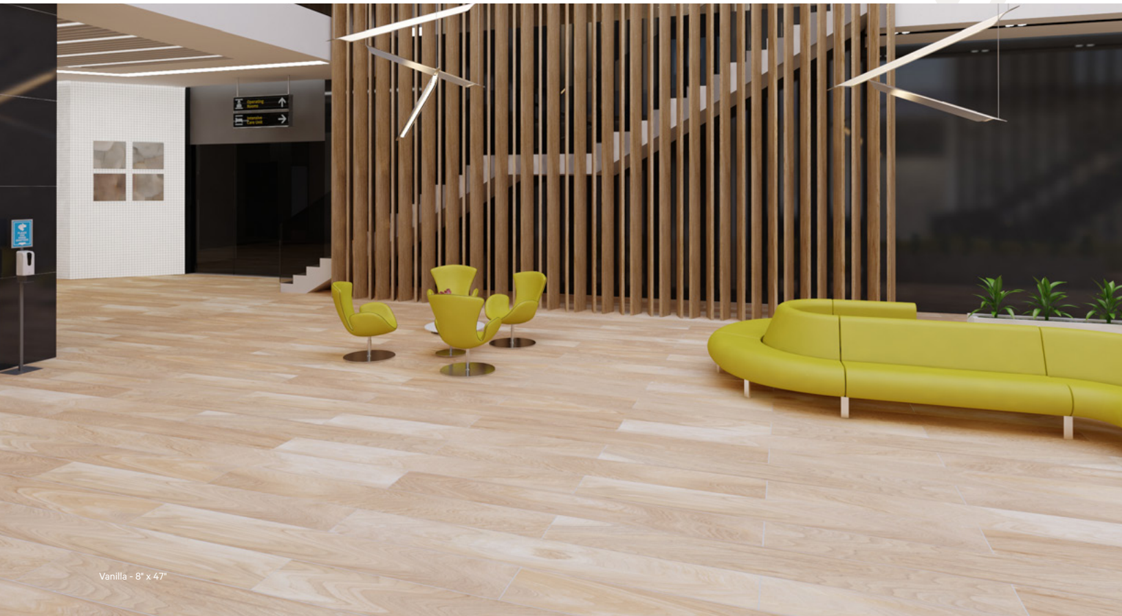
Vanilla - 8" x 47"

MIAMI PAIRS SOPHISTICATED WOODGRAIN LOOKS WITH THE DURABILITY OF PORCELAIN STONEWARE.