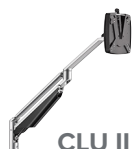
CLU II (no mount)