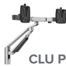
CLU Plus X2 (no mount)