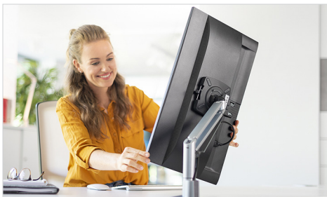
Smooth Rotation: Monitor rotation for landscape or portrait viewing.

Aluminum construction and Stabilus gas springs ensure long-lasting performance. These monitor arms are German engineered and held to the highest standards for quality and durability.