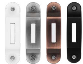
White Nickel Copper Black