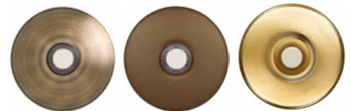
Antique Brass Architectural Bronze Polished Brass