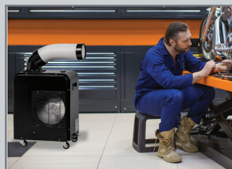
Garages and Workshops