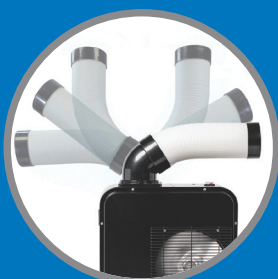
Hose Extends and Bends