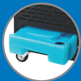
Easy empty bucket