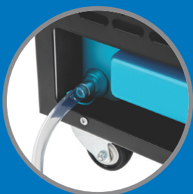
Continuous drainage with 6' hose included