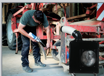
Farms and Sheds