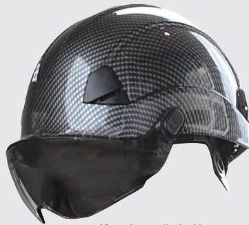
Visor shown attached to DPG22 Safety Helmet. Helmet sold separately.