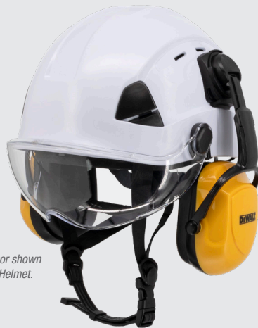
Capmount Earmuff and Visor shown attached to DPG22 Safety Helmet. Helmet sold separately.