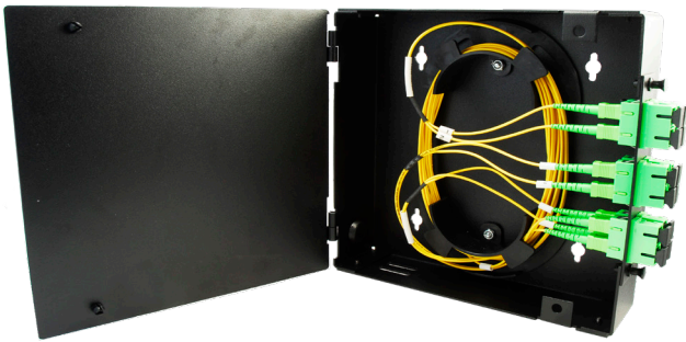
Enclosures are sold empty

This enclosure features a 3/4" knockout for maximum installation flexibility. The enclosure is fastened via secure plunger-and-grommet type closures.