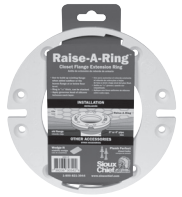
Hanger card packaging for counter areas.