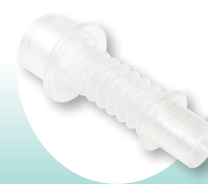
Tracheostomy Adult Flex Connector