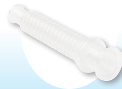
Universal 6" Flex Tube