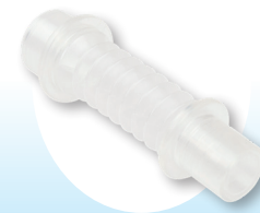
Tracheostomy Pediatric Flex Connector