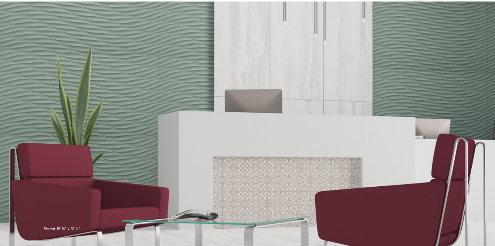
Forest 15 3/4" x 31 1/2"

INSPIRED BY HAND-CARVED STONE, THIS COLLECTION CAN CULTIVATE A CALMING OASIS.