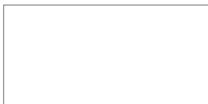
16" x 32"