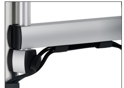
Cable clips keep wires organized to maintain a neat appearance.