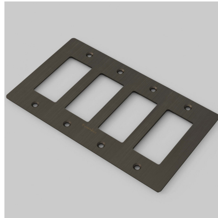
Shown in smoked bronze

The Buster + Punch Wall Plate features a clean and modern design with an industrial flair. Available in 1, 2, 3, and 4 gang wall plates in a variety of metal finishes. Each wall plate comes with inner plates and are ready to match up with Buster + Punch modules and detail kits. Mounts to standard flush mounted boxes. Note: Not all options are available. Note: Wall plates have a .16 inch shadow gap when installed. Learn more about Buster + Punch Electricity Collection here.