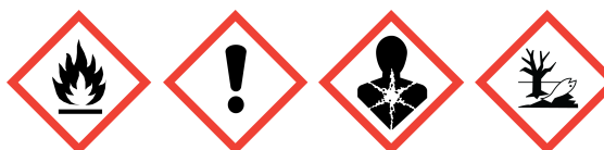
GHS02 GHS07 GHS08 GHS09

Signal word (CLP) : Danger Hazard statements (CLP) : H225 - Highly flammable liquid and vapour. H304 - May be fatal if swallowed and enters airways. H315 - Causes skin irritation.