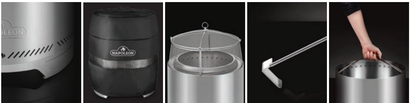
Included accessories: base ring, cover, spark screen, poker, and carry handle