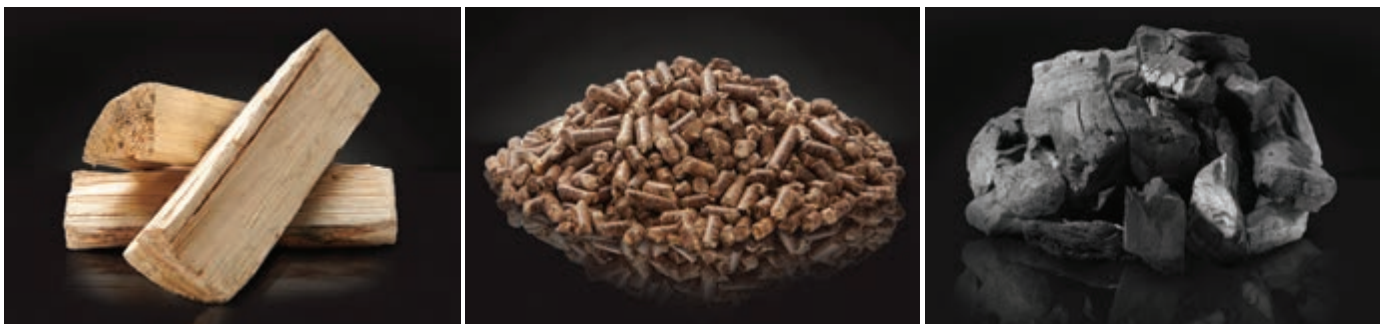
Fuel with wood or pellets for warmth and add charcoal to cook