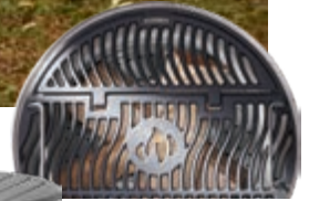
COOKING GRIDS S83018 / S83047 Sold separately