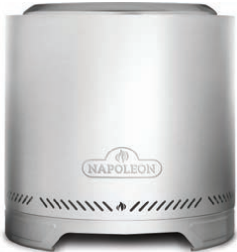
Built with premium 304 stainless steel and high-temp painted finish