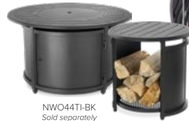
NWO44TI-BK Sold separately