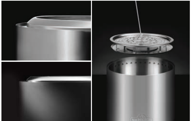
Two finish color options: stainless steel or phantom black (medium only)