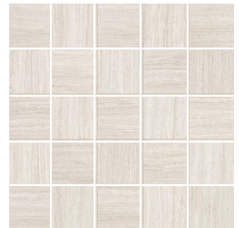
28110/M12 Sea Salt Mosaic