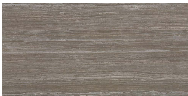
28155 12x24 Waters Edge