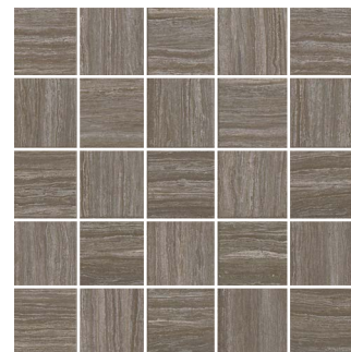
28155/M12 Waters Edge Mosaic