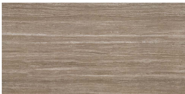
28190 12x24 Coconut Shell