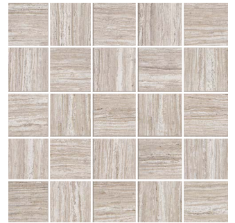
28115/M12 Marine Fog Mosaic