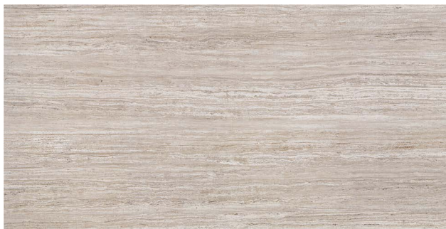
28115 12x24 Marine Fog