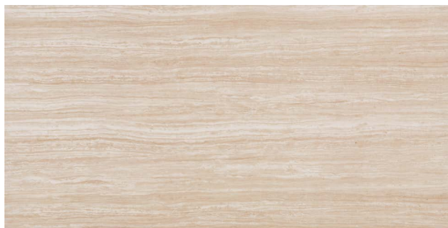
28130 12x24 Sand Castle