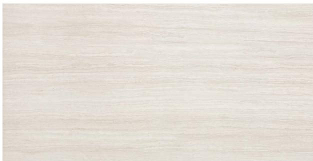
28110 12x24 Sea Salt