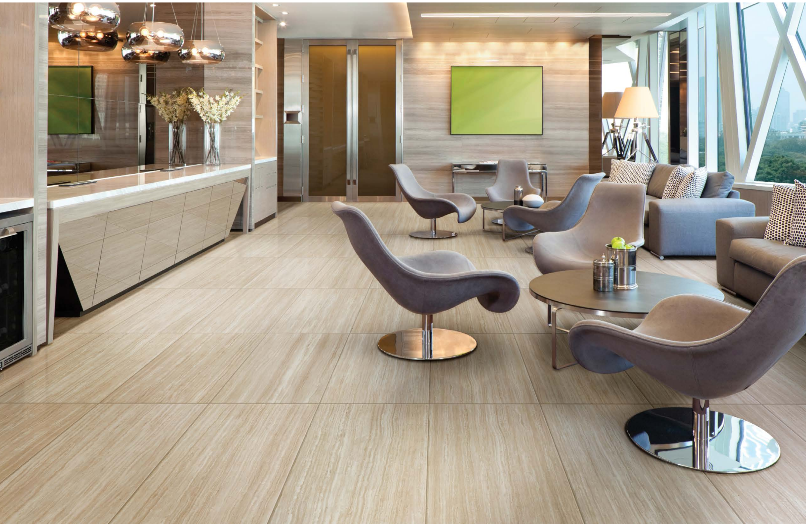
shown: 28130 12x24 Sand Castle