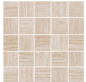
28130/M12 Sand Castle Mosaic