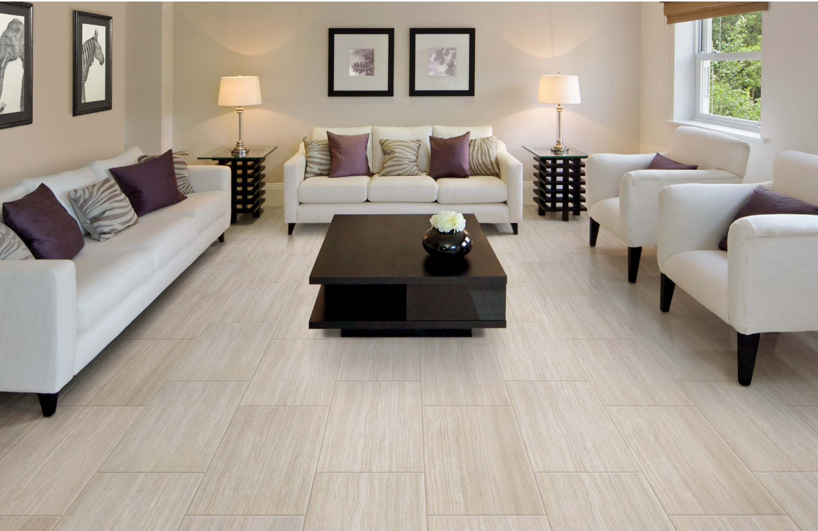
shown: 28110 12x24 Sea Salt