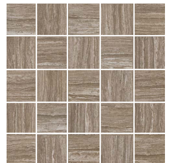
28190 /M12 Coconut Shell Mosaic