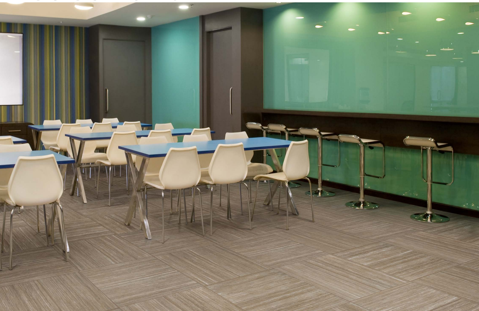
shown: 28190 12x24 Coconut Shell