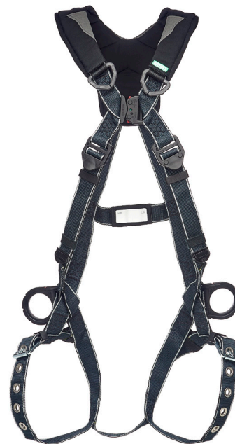
V-FIT Arc-Flash Full-Body Harness (PN 10252202) with back & hip D-rings and tongue-buckle leg straps