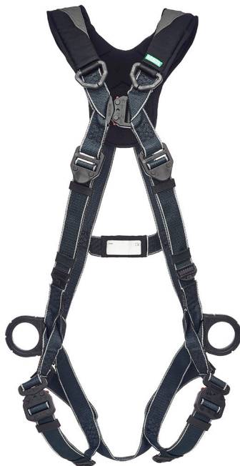
V-FIT Arc-Flash Full-Body Harness (PN 10252206) with back & hip D-rings and quick-connect buckle leg straps