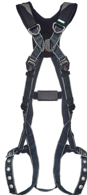
V-FIT Arc-Flash Full-Body Harness (PN 10252101) with back D-ring and tongue-buckle leg straps