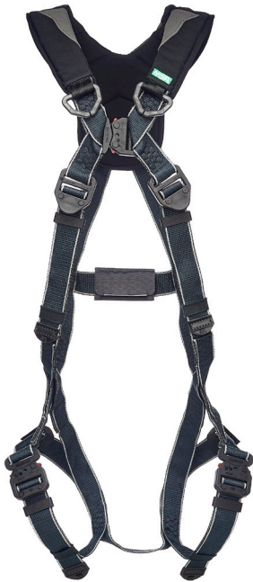
V-FIT Arc-Flash Full-Body Harness (PN 10252168) with back D-ring and quick-connect buckle leg straps