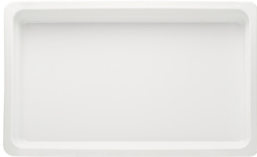
20 7 / 8 " x 12 5 / 8 " GN 1/1 Dish Item No. 630261512000000 H 3 / 4 " W12 3 / 4 " L20 7 / 8 " 49.71 oz./1470 ml. 1 pc. SCC B490385