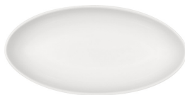
9 5 / 8 " x 4 5 / 8 " Oval Dish Item No. 630622312000000 H1 1 / 2 " W4 1 / 2 " L9 5 / 8 " 15.22 oz./450 ml. 6 pcs. SCC B212253