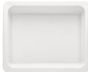
12 5 / 8 " x 10 3 / 7 " GN 1/2 Dish Item No. 630261212000000 H2 1 / 2 " W10 3 / 8 " L12 3 / 4 " 111.59 oz./3300 ml. 1 pc. SCC B456305