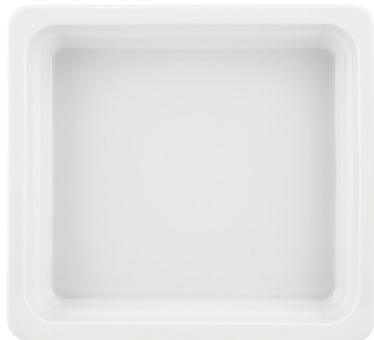
14" x 12 5 / 8 " GN 2/3 Dish Item No. 630261412000000 H2 1 / 2 " W12 3 / 4 " L14" 157.24 oz./4650 ml. 1 pc. SCC B466861