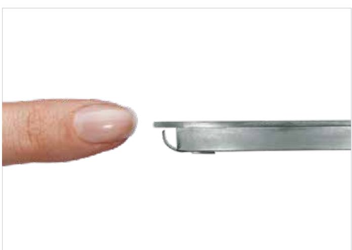
Thin profile: Just 1/4" (6 mm) depth when recessing 3/8" (9.5 mm) when surface mounting