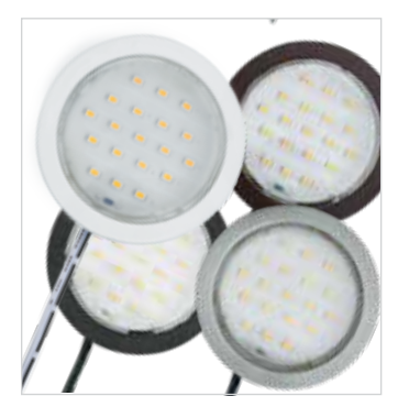
Available in 4 finishes, with clear lens