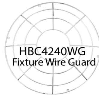
HBC4240WG Fixture Wire Guard