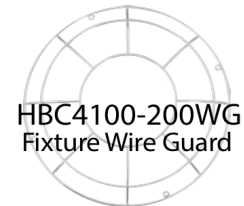
HBC4100-200WG Fixture Wire Guard