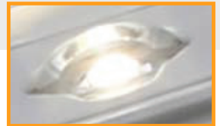
With patented french door lens