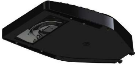
Single Module Front Shield