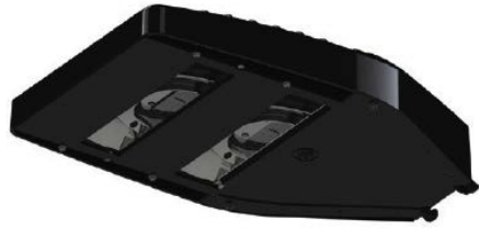
Double Module Front Shield