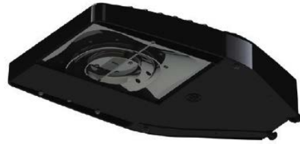
Double Module Left/Right Shield