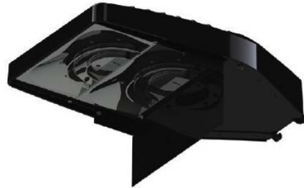
Double Module Back Shield