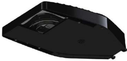
Single Module Left/Right Shield