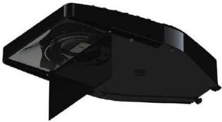
Single Module Back Shield