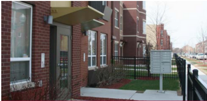
Cluster Box Units