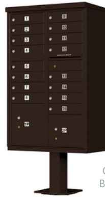
Cluster Mailbox Unit (CBU)