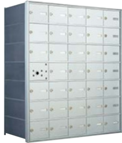
Horizontal Recess Mounted