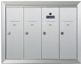
Vertical Recessed or Surface Mounted

The Vertical and Horizontal Mailboxes do not meet current USPS requirements for Centralized Mail Delivery. When an apartment community or other multi-unit dwelling is renovated, the property should replace the obsolete mail receptacles with the current USPS STD 4C mailboxes or CBU mailboxes.