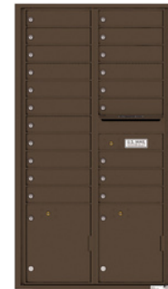
STD-4C Recessed or Surface Mounted